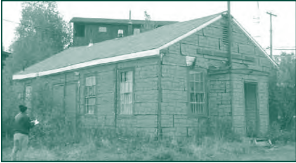
Boyles Brothers Shop