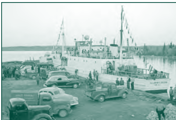
HISTORICAL Government Dock ships offloading 1940s