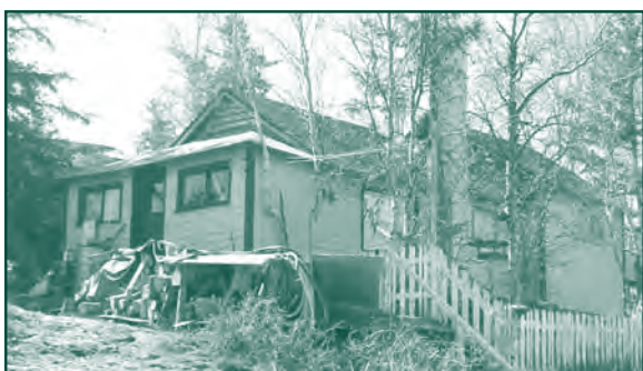
Log Cabin Incognito