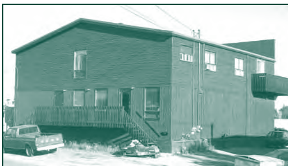
Original Capitol Theatre