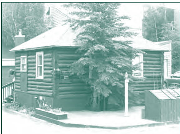
TD Bank cabin