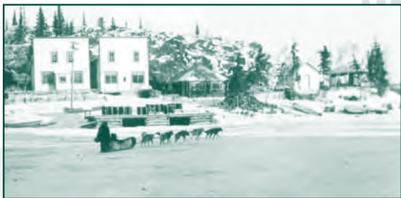
HISTORICAL Latham Island across the Narrows, 1940