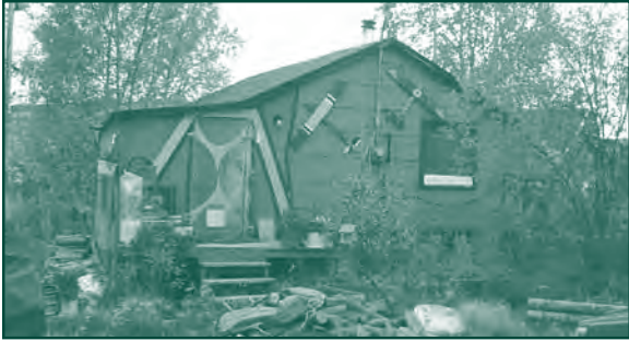
Quaint & Comfy