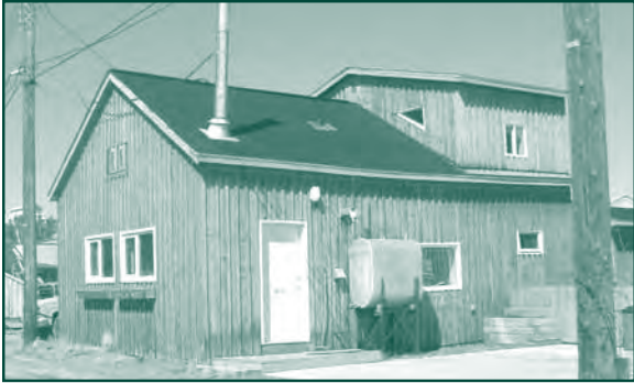
Refinery to Residence