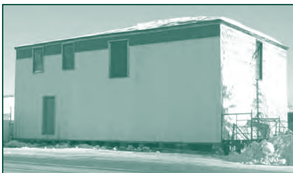
News of the North