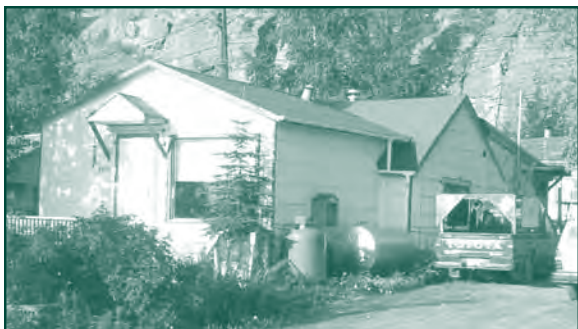
YK Glass Recyclers