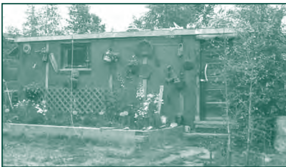
Cat Skinner's Caboose