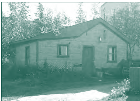
Davey Jones' Shack