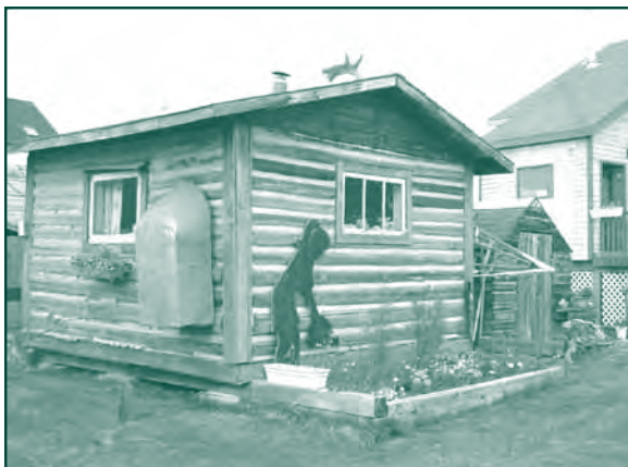
Old & New