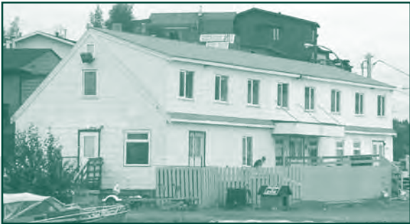
Canadian Pacific Airlines