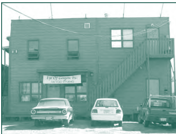
Original Sutherlands Drugstore