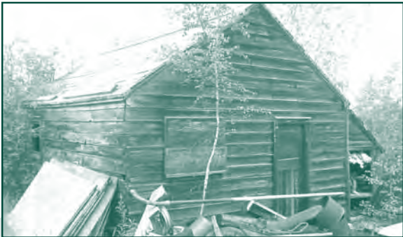
Warehouse Then and Now