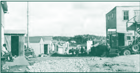
HISTORICAL Old Town Mainstreet 1947