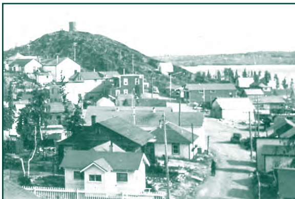
HISTORICAL Old Town view 1945

serious mining development. The Con Mine became the first NWT gold producer with the pouring of a brick on September 5, 1938. The Yellowknife we know today was born!