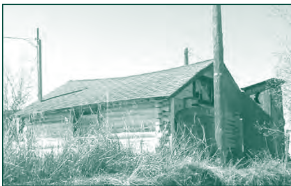
Glamour Alley Cabin