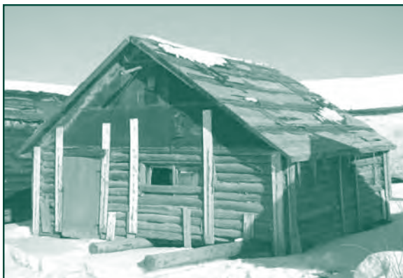
Old Log Cabin