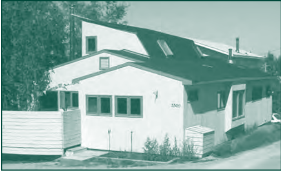
HBC Staff House