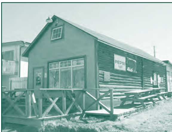
Original Weavers (now Bullocks)